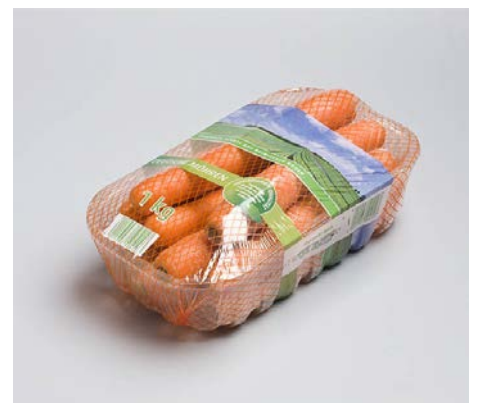
Film substrate printed with inks based on Joncryl® FLX 5060