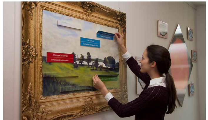
The exhibition “Sustainability – a Change of Perspective” makes sustainability tangible for the visitors.