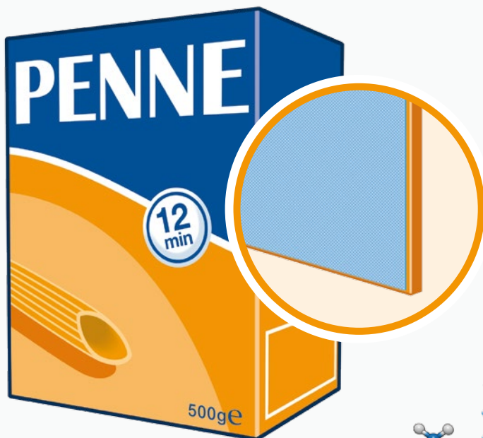
Cardboard packaging with BASF barrier solution.

A video animation on this topic can be found online: