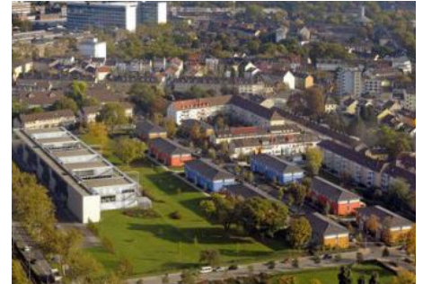
View from above: the LUWOGÉ Brunck residential quarter in Ludwigshafen.