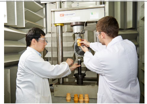
Technical experts are testing the noise level of Cellasto® components in the expanded Technical Center.

Ultramid® and Ultradur® are used in automotive parts and innovative applications including seat structures, oil sump modules, sensors, engine mounts, connectors and highly integrated laser-structured electronic devices. The expansion