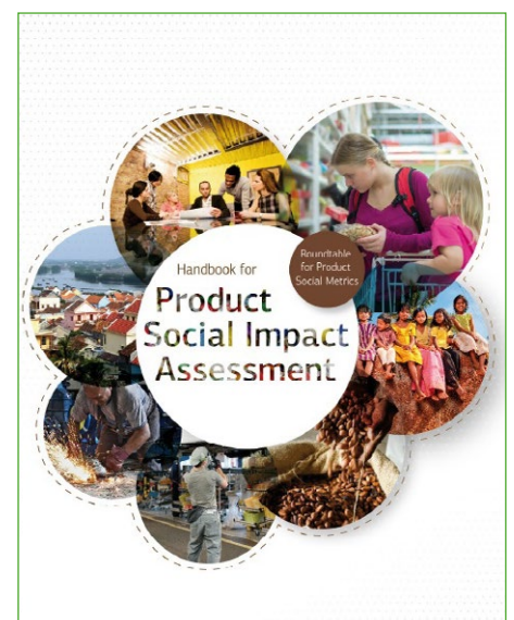
The handbook for social impact assessments of products is written for practitioners.