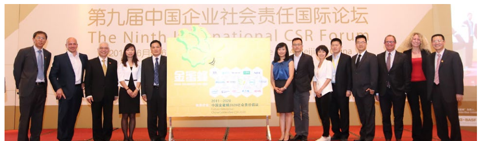
Business leaders and representatives from initiator companies and CSR Europe at the launching event of the new group actions under “Golden Bee 2020”.

During the forum, BASF participated in a workshop hosted by econsense and GIZ with other German-based companies to share experi-