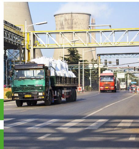
„Together for Sustainability“ aims at enhancing sustainability within the supply chain.

(ISO), Social Accountability International (SAI) and others.